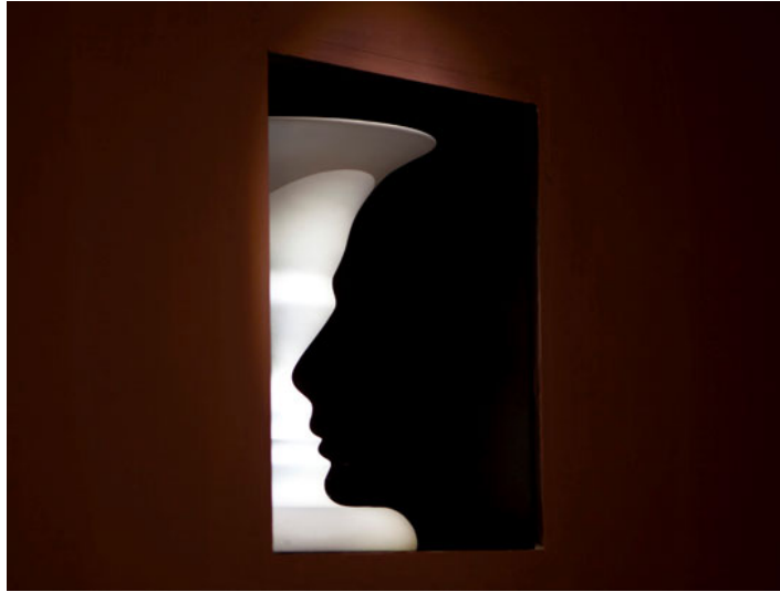
They lived in different periods and different continents! Car paint on fiber, 36cm in diameter, height 40 cm, 2013

Murder in Three Acts was created in partnership with Delfina Foundation's artist-in-residency program. The project was produced in association with Manifold Projects. NON presents the exhibition from March 1 to April 13, 2013, in Istanbul.