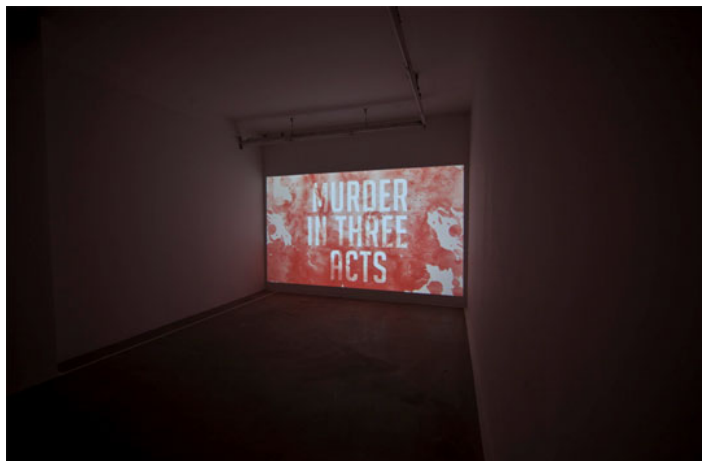
Murder in Three Acts, HD film, 3 Episodes, English with sound, 2012-13

Asli Cavusoglu has constructed a mental maze for her multi-layered project Murder in Three Acts . With a successive set of episodes, the project constantly shifts as it interacts with the space in which it takes place. Furthermore, the artist perpetually rearticulates the process with diverse and uncontrollable collaborative input. Murder in Three Acts was first designed as a real-time performance in three episodes, mounted during Frieze London in 2012. The art-fair booth was separated into two parts: an exhibition of artworks/objects and an ad-hoc forensics lab in which a professional cast of actors examined objects as evidence. The project questions the processes of legitimization that surround us by posing a set of questions: What is truth? What is scientific fact? What is witnessing? What is seeing? What is believing? How do we define knowledge? How do we filter information? Not only the art fair context, but also knowledge in general was challenged and questioned in this booth. As a space for knowledge production, the paired exhibition space demanded a reciprocal relationship between the project and the audience. Hence, the crime drama was even discussed and rehearsed as an improvisational act. This act constantly oscillated between staging the process and losing control over it.